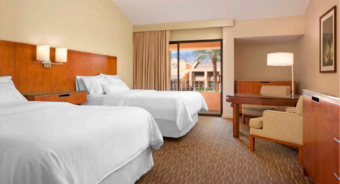
Room with two Queen beds