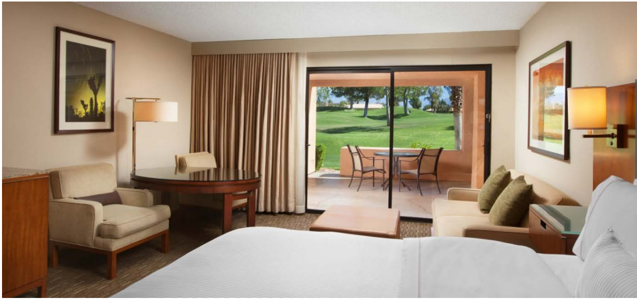
Deluxe View first floor rooms will have some view of either golf course (above) or pool (below)