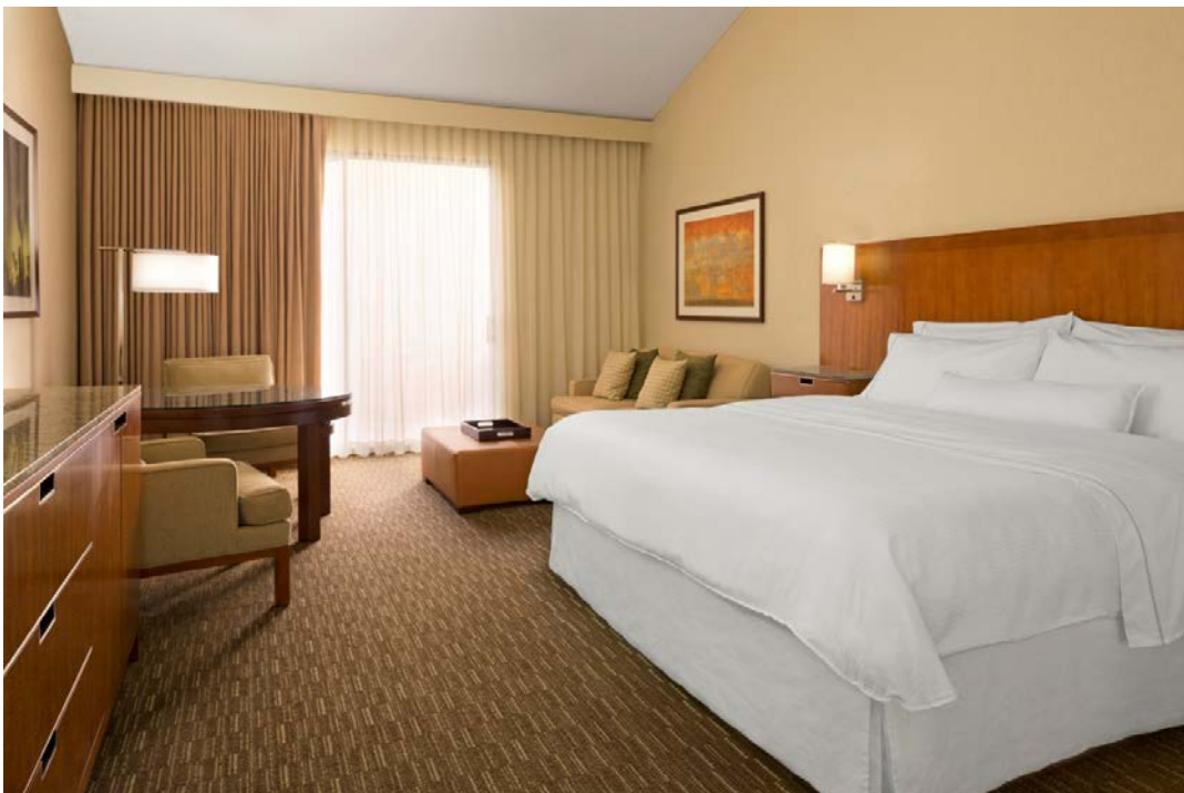
Second floor rooms, Traditional or Deluxe View, have vaulted ceilings with balconies.