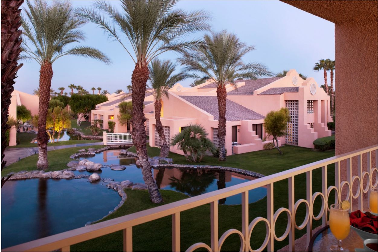
Deluxe View second floor rooms have some view of pool or golf course