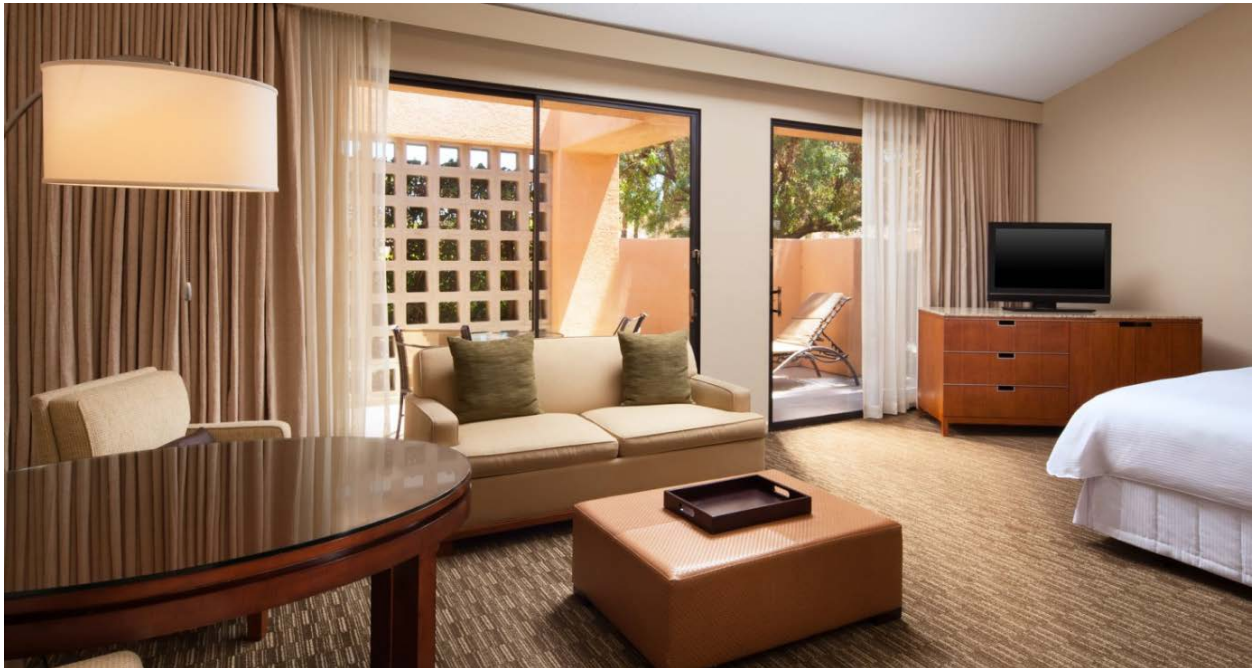
Traditional rooms will not have view of pool or golf course but will have a patio or balcony.