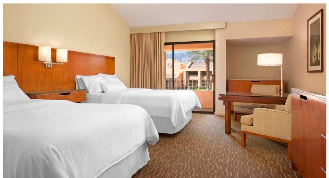
Room with two Queen beds