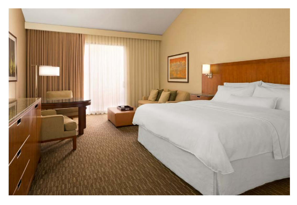
Second floor rooms, Traditional or Deluxe View, have vaulted ceilings with balconies.