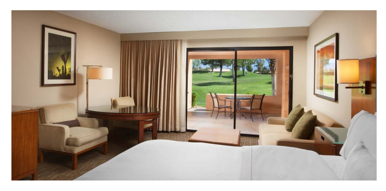
Deluxe View first floor rooms will have some view of either golf course (above) or pool (below)