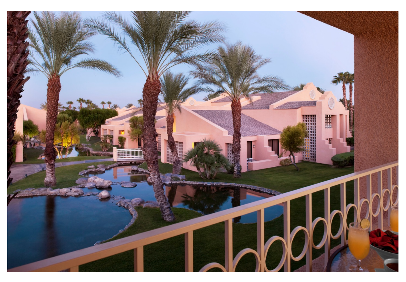
Deluxe View second floor rooms have some view of pool or golf course